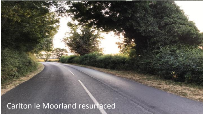
Carlton le Moorland resurfaced