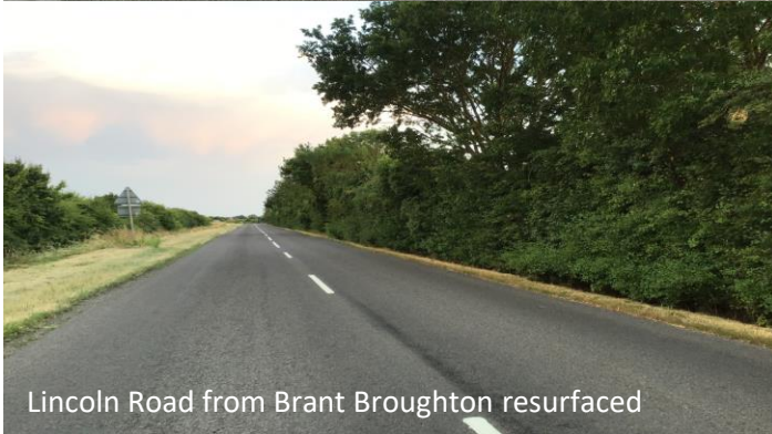
Lincoln Road from Brant Broughton resurfaced