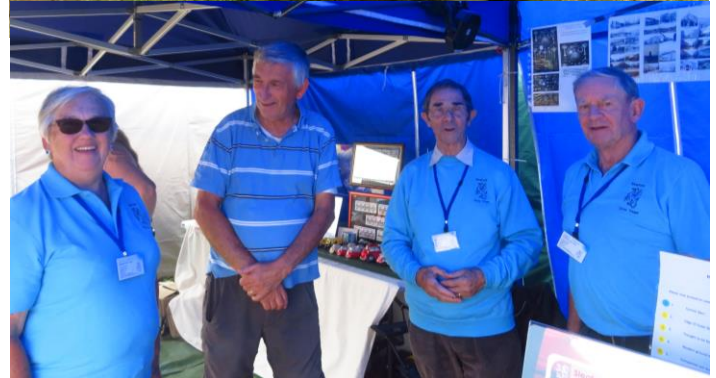
Sleaford Museum and Civic Trust on duty