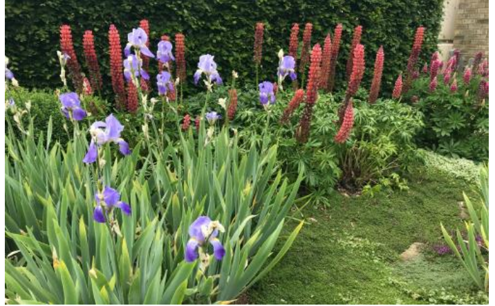
Scented herbal path between colourful borders.

Huge thanks to all for their work on the Open Gardens that followed the Jubilee events.