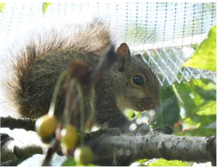
Baby Squirrel inside the net that protects the cherries!