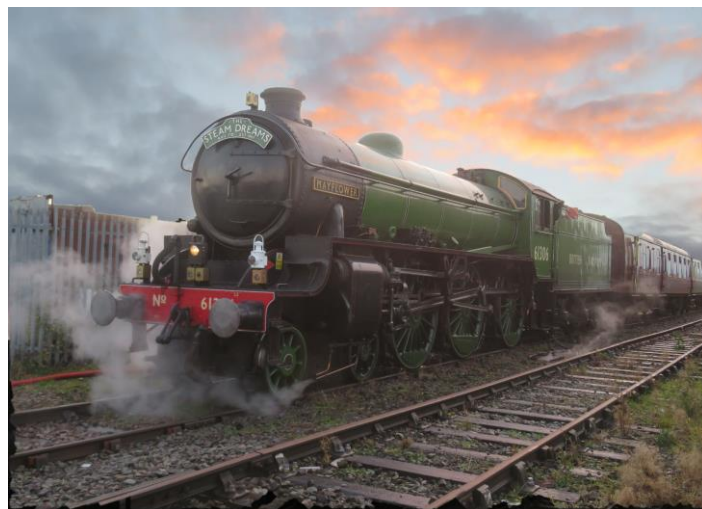
The London to Lincoln Christmas Market Steam train.