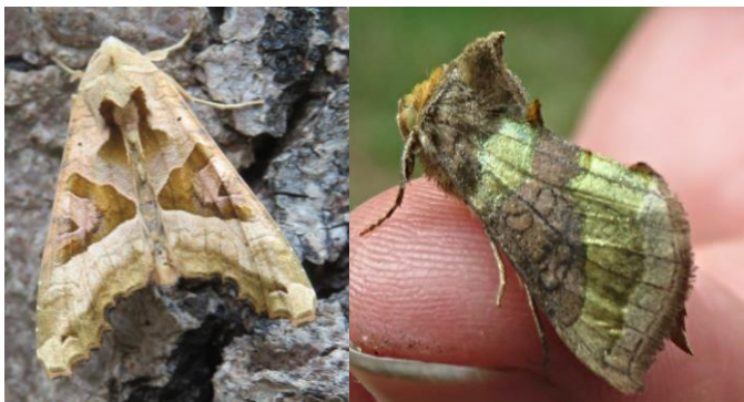
Above: Angleshades and Burnished Brass

Bats and Moths came out in good numbers for our fun Wildlife Watch camp at Hilltop Farm, Welbourn, discovering more about nocturnal animals in our gardens. Next is the Autumn Crafts on September 15 th , linking with the Welbourn School event on the same day! Contact me or Jean on 01636 626176.