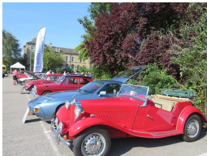
The Council's Car Park doubles nicely as a Vintage Car Rally