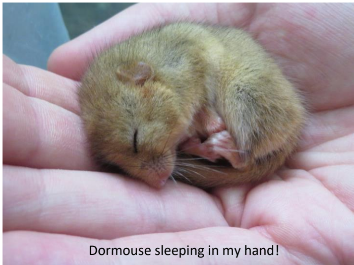
Dormouse sleeping in my hand!

Our Wildlife Watch Group joined an official survey checking dormouse boxes at Chamber's Wood. The kestrel chick below was one of four in an owl box, near our house, where we have been gardening for wildlife for many years. So we can track its future, it was ringed by expert Alan Ball, who used to be our road safety officer! Next meeting for Wildlife Watch and RSPB Explorers is Sea Dipping and sand sculptures on Sunday 15 th July at Gibraltar Point. Book 01636 612 683