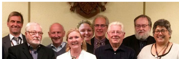
Lincolnshire Independents at North Kesteven District Council

Grants for disabled facilities in homes will continue and a new Heritage Grant Aid of £25,000 is in place.